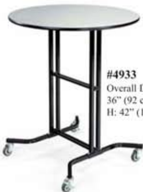
#4933 Overall Dims: 36" (92 cm) Diameter H: 42" (107 cm)