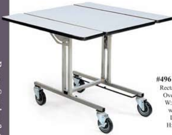
#4961 Rectangular Tabletop (35.5" x 39") Overall Dims: W: 39" (99 cm) or 24.5" (62 cm) with drop leaves down L: 35.5" (90 cm) H: 29.5" (75 cm)