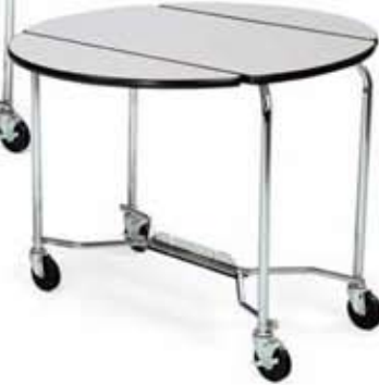
#4953 Oval Top (36" x 43") Overall Dims: W: 43" (109 cm) or 24.5" (62 cm) with drop leaves down x L: 36" (91 cm) x H: 31" (79 cm)