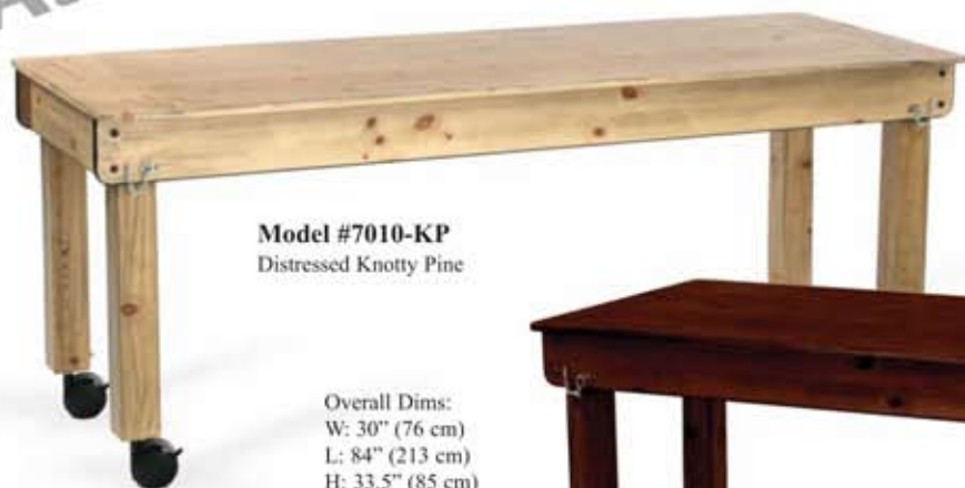
Model #7010-KP Distressed Knotty Pine

Beautiful Furniture Grade Finish eliminates the need for costly skirting