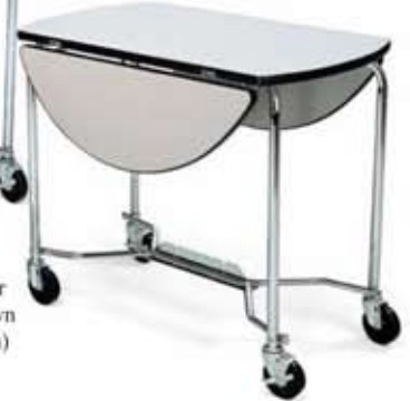
#4956 Oval Top (36" x 43.5") Overall Dims: W: 43.5" (110 cm) or 22.5" (57 cm) with drop leaves down x L: 36" (91 cm) x H: 31" (79 cm)