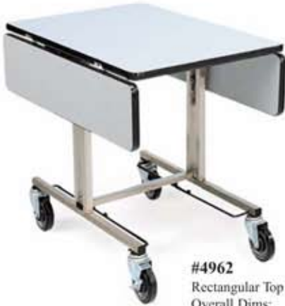
#4962 Rectangular Top (35.5" x 39") Overall Dims: W: 39" (99 cm) or 22.5" (57 cm) with drop leaves down L: 35.5" (90 cm) H: 29.5" (75 cm)