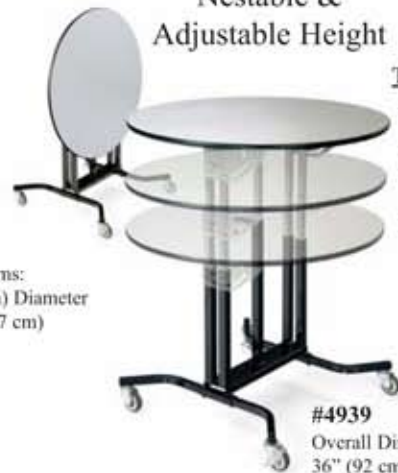
#4939 Overall Dims: 36" (92 cm) Diameter H: 42" (107 cm)