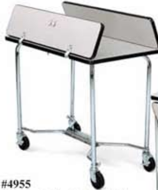
#4955 Rectangular Top (35.5" x 39.5") Overall Dims: W: 39.5" (100 cm) or 22.5" (57 cm) with drop leaves down x L: 35.5" (90 cm) x H: 31" (79 cm)