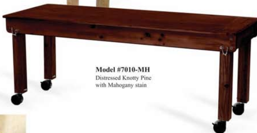
Model #7010-MH Distressed Knotty Pine with Mahogany stain

Overall Dims: W: 30" (76 cm) L: 84" (213 cm) H: 33.5" (85 cm) Folded Dims: H: 5.5" (14 cm)