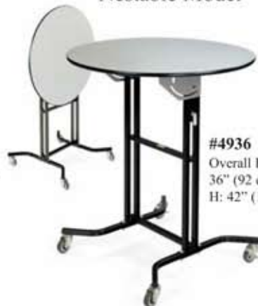
#4936 Overall Dims: 36" (92 cm) Diameter H: 42" (107 cm)