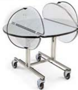
#4960 Oval Top (36" x 43.5") Overall Dims: W: 43.5" (110 cm) or 22.5" (57 cm) with drop leaves down L: 36" (91 cm) H: 29.5" (75 cm)