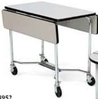
#4952 Rectangular Top (35.5" x 39") Overall Dims: W: 39" (99 cm) or 24.5" (62 cm) with drop leaves down x L: 35.5" (90 cm) x H: 31" (79 cm)